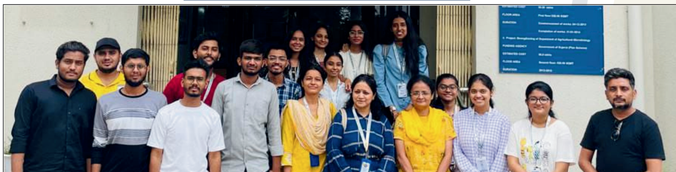
Industrial visit for the students of B.Sc and M.Sc (Gandhinagar Institute of Science) at Anand Agricultural University